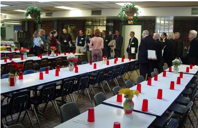
A S.O.M.E. Daily Dining Room serves hundreds