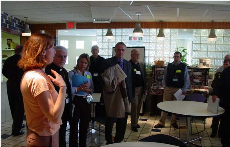
A S.O.M.E. Affordable Housing Facility