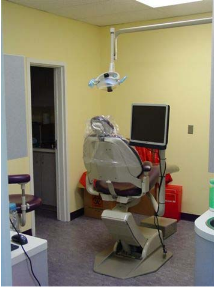
The S.O.M.E. Dental Clinic