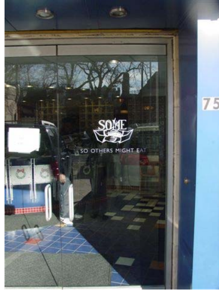
The S.O.M.E. housing office