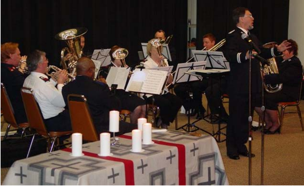
The Salvation Army provided a brass ensemble for Thursday morning worship