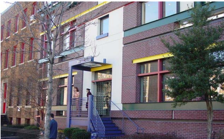
The Clinic Entrance of S.O.M.E.