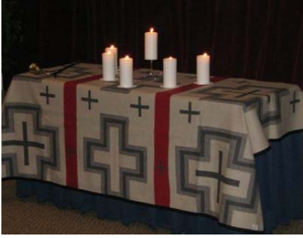
The table bore a candle for Christ and five candles to represent the five families of CCT.