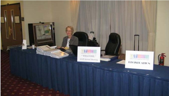
Participants were warmly greeted at the Conference Center at the Maritime Institute in Baltimore