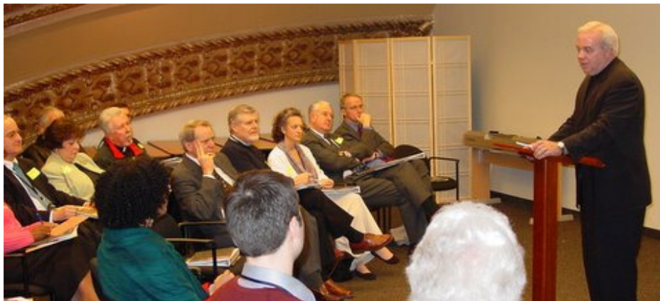
Jim Wallis of Sojourners shares with representatives of CCT.

The entire group (including 18 seminarians who joined us for the day) toured S.O.M.E. (So Others Might Eat – a local ministry to the hungry and poor in Washington D.C.) and heard about the anti-poverty work of several CCT participant organizations including Bread for the World, Habitat for Humanity, Sojourners, and World Vision.