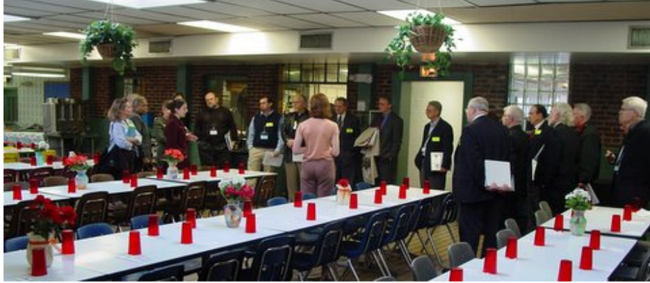
CCT representatives visit the dining room of S.O.M.E. in Washington D.C.

(more pictures at www.ChristianChurchesTogether.org )